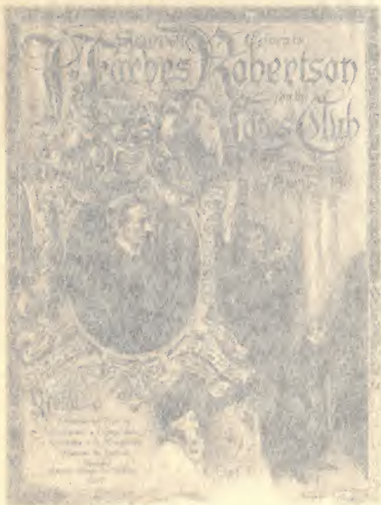
Menu of supper to J. Forbes-Robertson, 1910